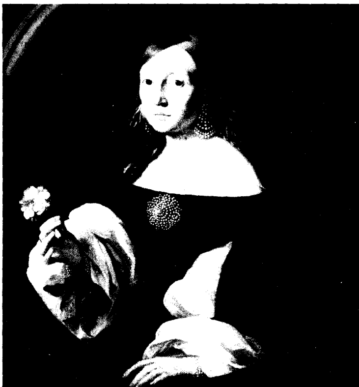
Fig. 7. after Murillo, Portrait of a Lady (Doña Isabel de Malcampo?) , The Stirling Maxwell Collection, Pollok House.

Before he succeeded to his father's estates, his collecting was more limited and had included some paintings bought in Spain, such as four oil sketches by Goya of boys playing, purchased in Seville in 1842 from an unknown source 45 . Later, as we shall see, he bought some works through his Spanish contacts. He also occasionally picked things up at dealers. When he bought the supposed Portrait of Isabel de Malcampo (fig. 7) and