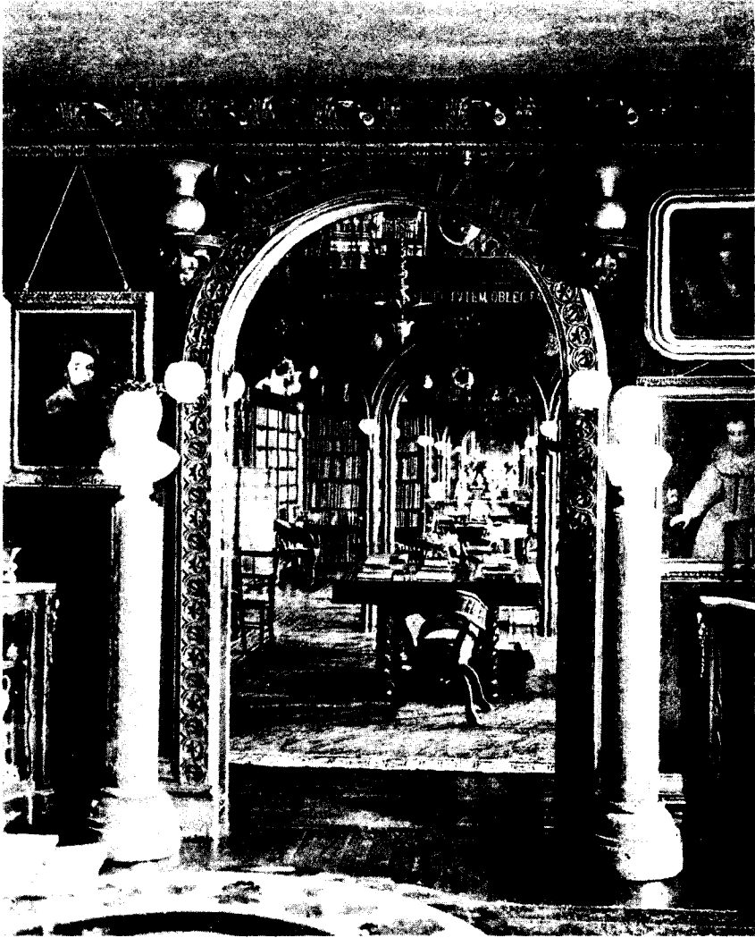
Fig. 3. The Library, Keir House, frontispiece, Miscellaneous Essays and Addresses, vol. V, in The Works of Sir William Stirling Maxwell, London, 1891.

cribed by Dr. Waagen who found it «too remarkable a room not to be mentioned» in his Galleries and Cabinets of Art in Great Britain 40 (fig. 3). His book collection covered everything from Spanish art to proverbs and