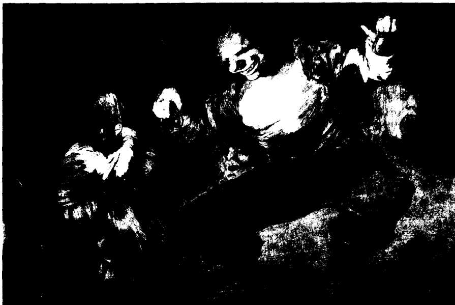
Fig. 8. Francisco de Goya, Disparates Plate 4: Bobalicón , Glasgow Museums: The Stirling Maxwell Collection, Pollok House.

By the time the Annals were published, he was also fascinated by Goya's etchings, though he did not yet know Los Disparates and had not seen the Desastres de la Guerra 57 .