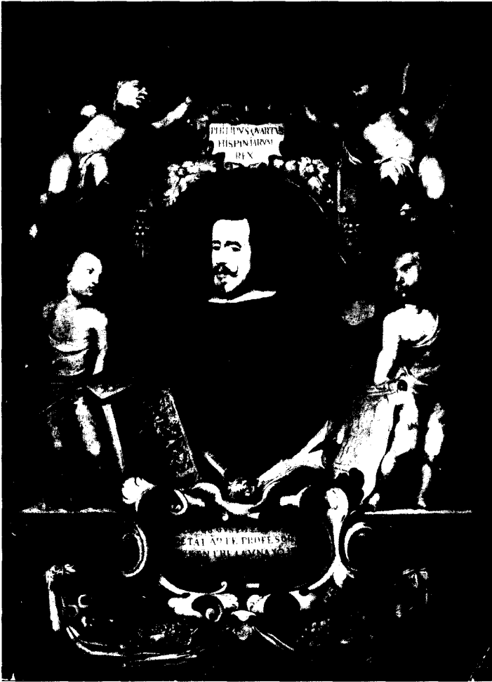
Fig. 10. Juan Martínez de Gradilla, Portrait of Philip IV, Glasgow Museums: The Stirling Maxwell Pollok House.