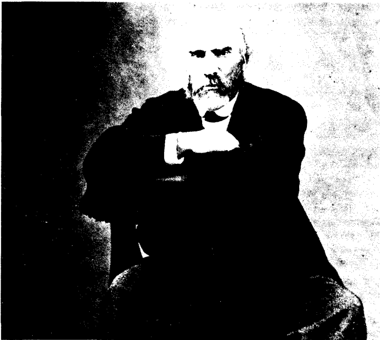
Fig. 1 Sir William Stirling Maxwell, photograph, c. 1865.

This article sets out to fill in some of the many gaps in the published information available on William Stirling, later Sir William Stirling Maxwell (fig. 1), and to examine whether some of the common views of him as an