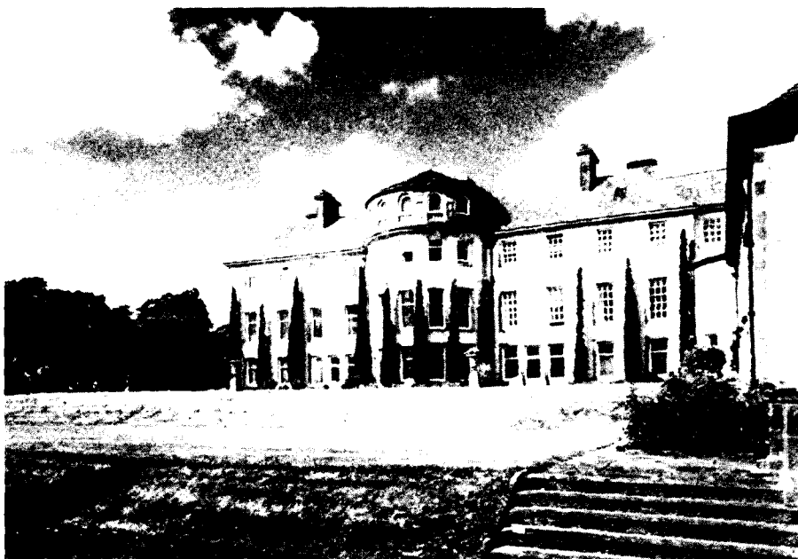
Fig. 2. Keir House, Perthshire, Scotland.

Stirling was already a confirmed bibliophile and had been collecting pictures since he first travelled to the Continent in 1839-40. In the early 1850s, he commissioned major alterations to the house and grounds at Keir, and installed a spectacular two-storey library in the bow front at the centre of the house. (fig. 2) The mottoes carved on shelves and furniture were des-