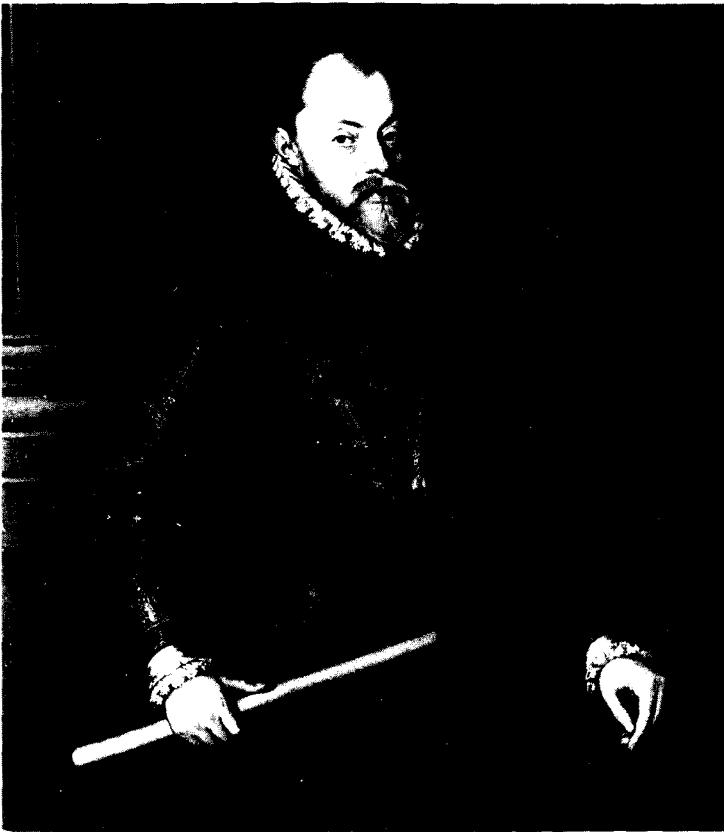
Fig. 6. Alonso Sánchez Coello, Portrait of Philip II, Glasgow Museums: The Stirling Maxwell Collection, Pollok House.

Stirling's collection of Spanish art was acquired in several ways. The majority of the important pictures came from several major sales of Spanish paintings in London in the late 1840s and early 1850s, most notably those of Louis-Philippe's Galerie Espagnole and the collection of Frank Hall Standishwhich, the French king had also owned, in 1853. Stirling, who had focused on the role of artists in his Annals , was particularly interested in the portraits of artists in these sales, such as Vicente Carducho's Self Portrait , an engraving of which had been one of the illustrations in the Annals 44 (fig. 5). Also of particular interest to him were portraits of the Spanish Habsburgs,