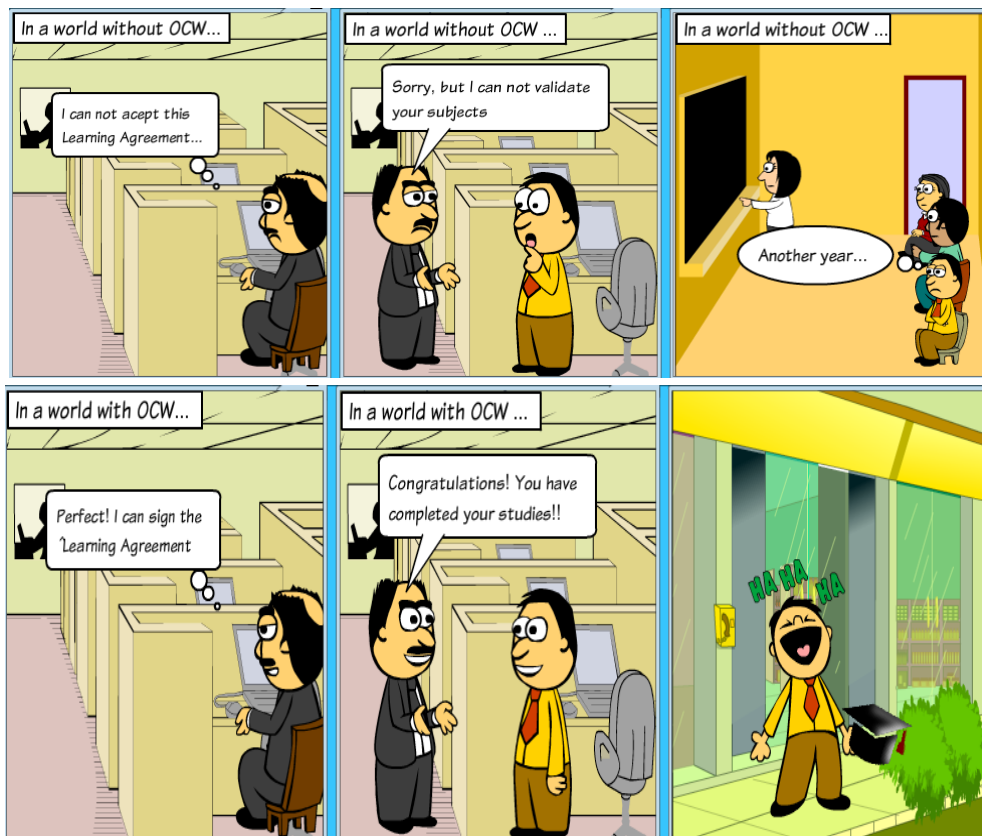
Figure 3. A comic representing a scenario for credit transfer mobility program The comic was created through software application available at Toondoo.com